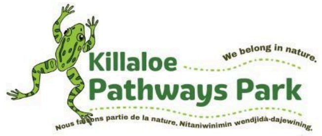
Trilingual Signage: Green