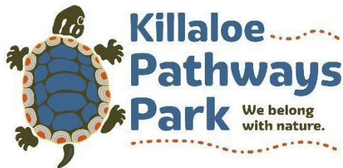
English Signage: Blue