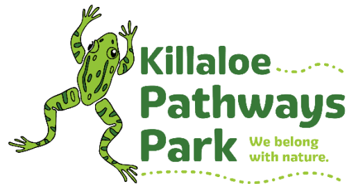
English Signage: Green