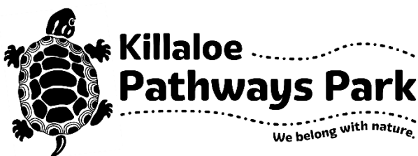
Turtle Signage: Black and White