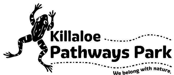
Frog Signage: Black and White