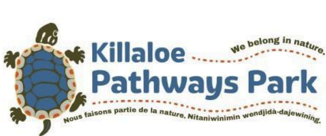
Trilingual Signage: Blue

This guide must be used in the creation any products that represent the park including but not limited to: signage, website design, media releases, documents, brochures and social media.